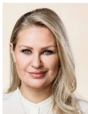
Ms Britt BAGER Committee on European Affairs The Liberal Party - Renew Europe