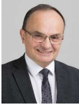
Mr Igor PIMENOV European Affairs Committee "Concord" Social Democratic Party - S&D