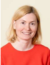
Ms Riina SIKKUT Vice-Chair, The European Union Affairs Committee Social Democratic Party - S&D