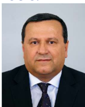
Mr Hasan ADEMOV Chair, Committee on Labour, Social and Demographic policy Movement for Rights and Freedoms - Renew Europe