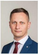
Mr Dmitri DMITRIJEV Finance Committee Estonian Centre Party - Renew Europe