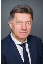
Mr Algirdas BUTKEVICIUS Vice-Chair, Committee on Budget and Finance Lithuanian Social Democratic Party - S&D