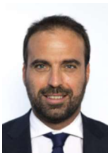
Mr Luigi MARATTIN Committee on Budget, Treasury and Planning Italia Viva - Renew Europe