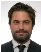
Mr Georges-Louis BOUCHEZ Committee on EU Affairs MR - Renew Europe