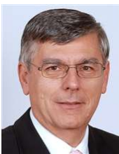
Mr Željko REINER First Deputy Speaker of the Croatian Parliament Croatian Democratic Union - EPP