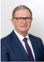
Mr Karlheinz KOPF Chair, Committee on Finance ÖVP - EPP