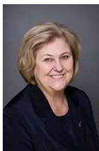
Ms Rimantė ŠALAŠEVIČIŪTĖ Chair, Committee on Social Affairs and Labour Lithuanian Social Democratic Labour - Non-attached